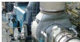
Hot Gas and Turbo Expanders