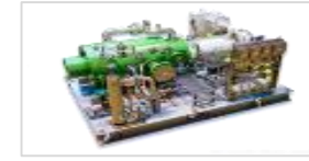
Integrated Compressor line