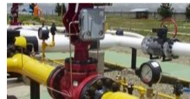
Process, Control and Safety Valves