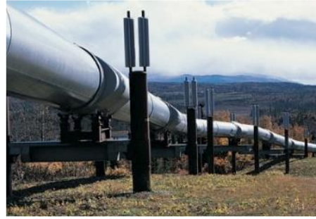
Pipeline and Gas Processing