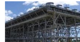
Air-cooled Heat Exchangers