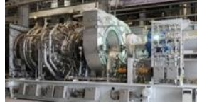
Heavy Duty GTs