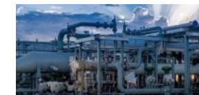
Small Scale LNG

Service support and optimized assets & operations across all segments