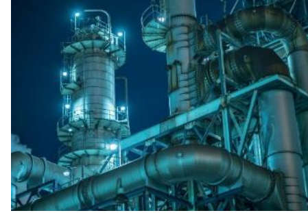
Refinery and Petrochemical