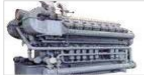
Slow Speed and Integrated Gas Engines