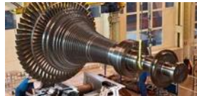
Industrial steam Turbines