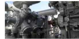
High Speed Reciprocating