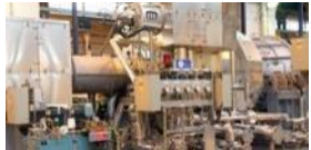
API Steam Turbines