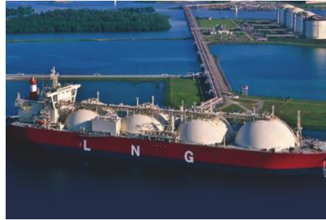
Liquefied Natural Gas