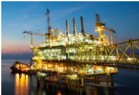
Onshore and Offshore Production

Leverage global scale with powerful local impact