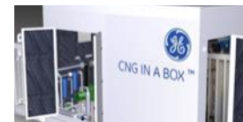
Small Scale CNG