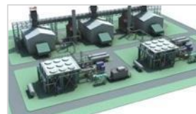
Waste Heat Recovery