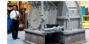
Gear Solutions and Bearings