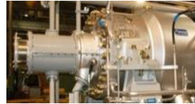
Centrifugal and Axial